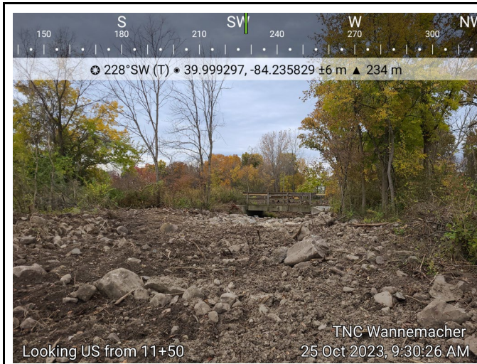
Photograph 1: Channel grading and constructed riffle near pedestrian bridge at Sta 10+50.