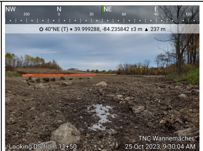
Photograph 2: Channel grading, boulder toe w branch packing and toewood revetment downstream of 11+50.