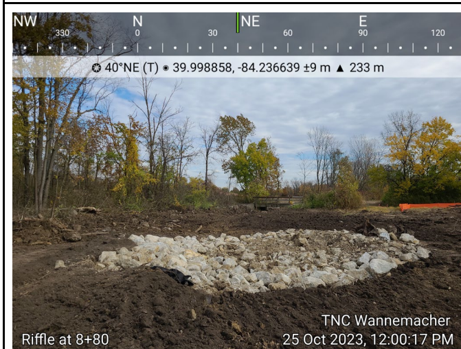
Photograph 3: Constructed rock riffle near Sta 8+80.