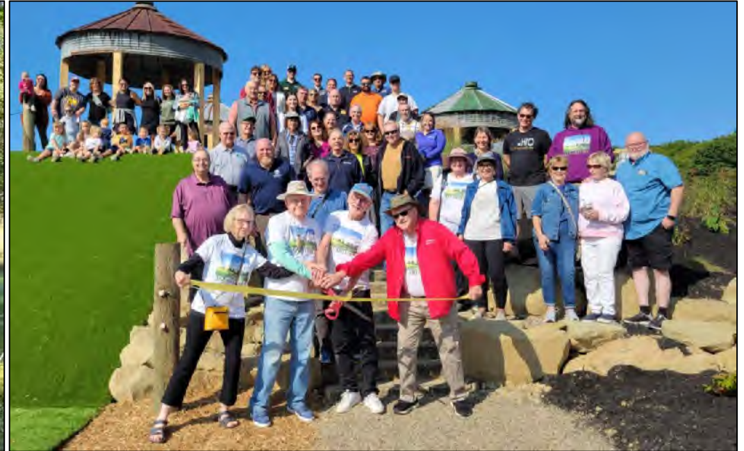
Playscape at Allardale Park

WHEREAS, District agrees to involve the Becky Shotwell family in the creative development of the Property, including, but not limited to, tree selection and naming for any development on the Property.