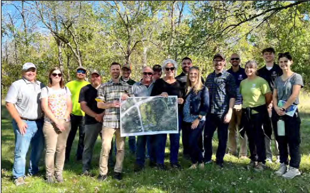
Shotwell Gardens at Lake Medina